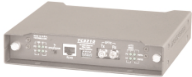
TC3210S Standalone Unit